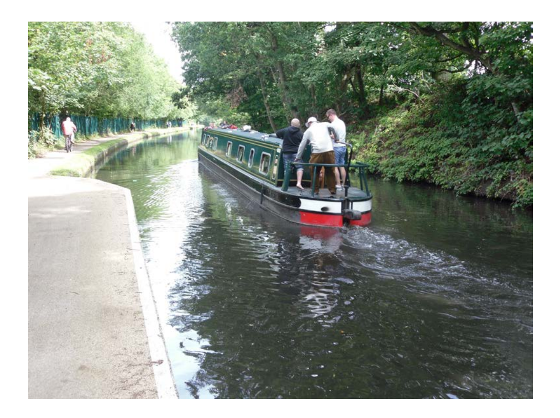
Worcester & Birmingham canal at Birmingham university