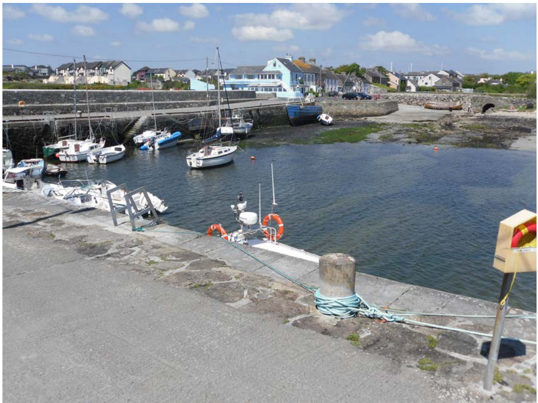
Barna harbour, Galway Bay