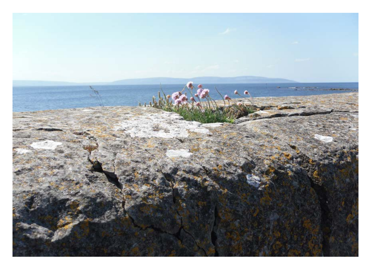
Galway Bay from Barna